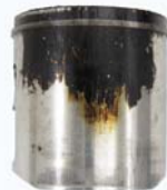
Leading Oil Brand