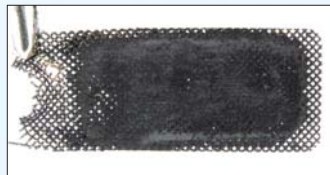
Leading Oil Brand