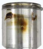
AMSOIL SABER® Professional