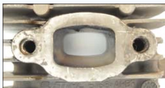
AMSOIL SABER Professional