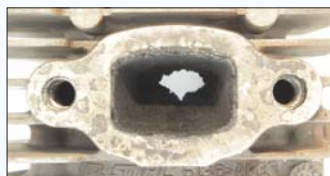
Leading Oil Brand