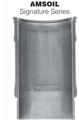
Severely Scuffed Liner