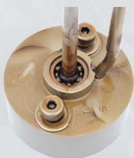
AMSOIL SYNTHETIC MULTI-VISCOSITY HYDRAULIC OIL (ISO 46)

Excessive oxidation results in harmful deposits and varnish that cause a host of problems, including stuck valves and decreased efficiency. In severe oxidation testing, AMSOIL Synthetic Multi-Viscosity Hydraulic Oil resisted elevated heat and oxidation more effectively than the conventional fluid.