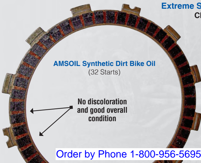
AMSOIL Synthetic Dirt Bike Oil (32 Starts)

No discoloration and good overall condition