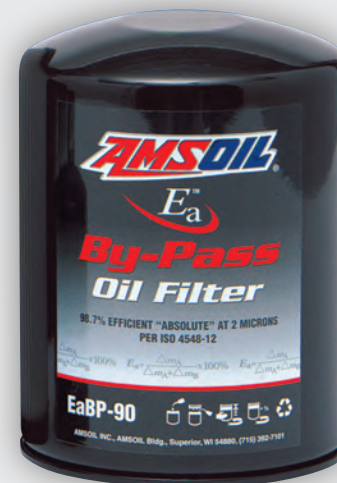
EaBP90 • EaBP100 • EaBP110 • EaBP120

AMSOIL Ea Bypass Oil Filters provide maximum filtration protection against wear and oil contamination. Working in conjunction with the engine's full-flow oil filter, AMSOIL Ea Bypass Filters operate by filtering oil on a "partial-flow" basis. They draw approximately 10 percent of the oil sump's capacity at any one time and trap the extremely small, wear-causing contaminants that full-flow filters can't remove. AMSOIL Ea Bypass Filters typically filter all of the oil in the system several times an hour, so the engine continuously receives analytically clean oil.